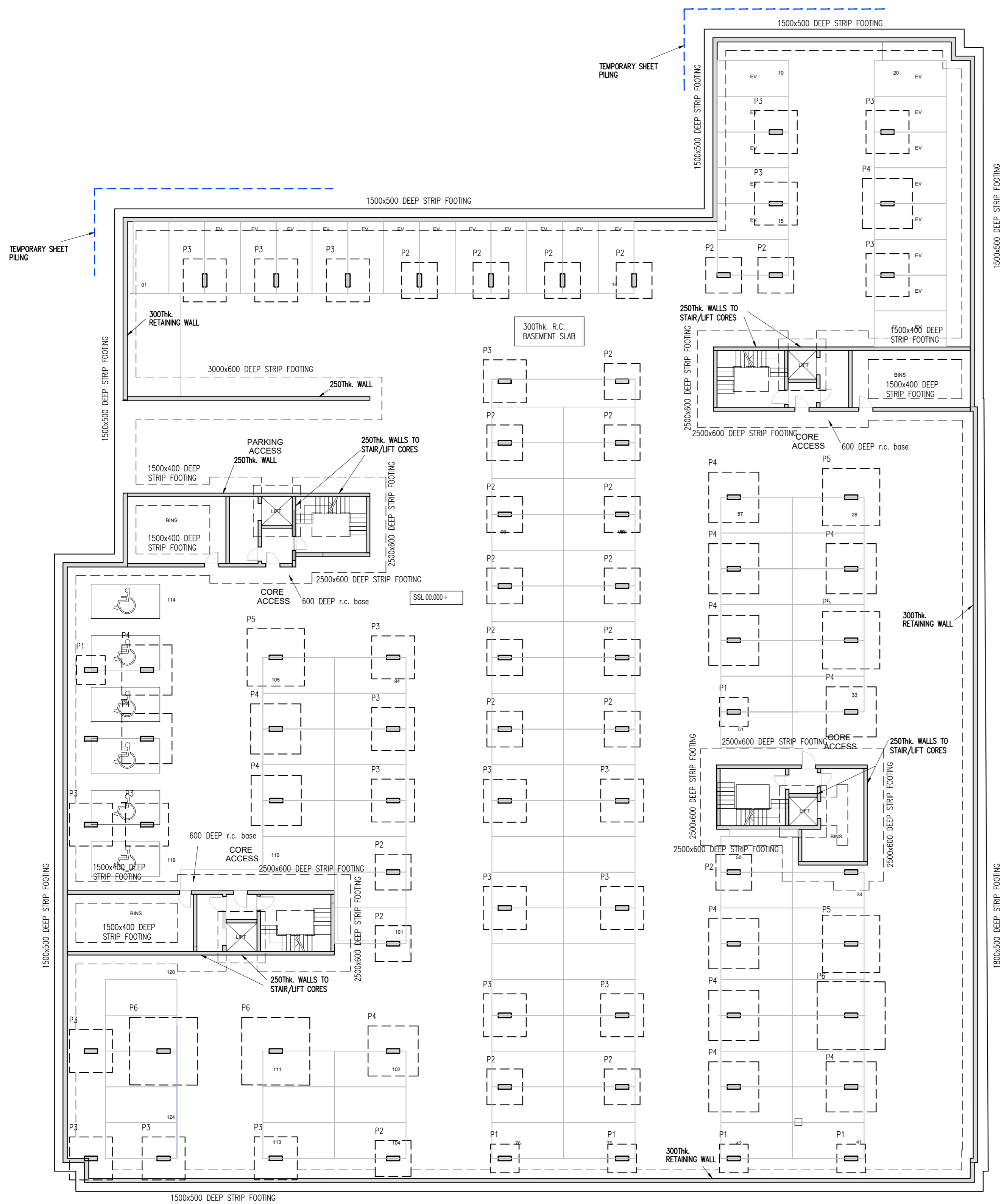
FOUNDATION PLAN (1:200)